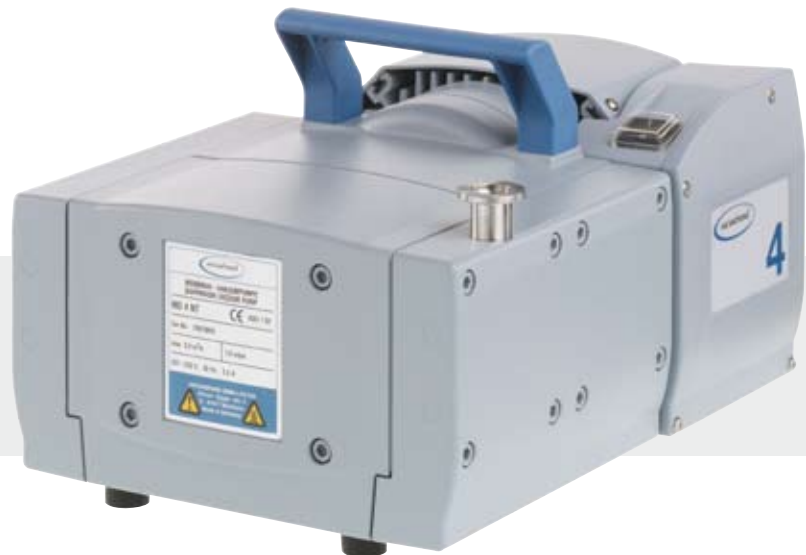
MD 4 NT 3.8 m 3 /h 1 mbar