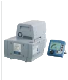
MD 4 NT VARIO 5.7 m 3 /h 1 mbar